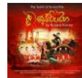
THE SPIRIT OF SURIYOTHAI ▶ CLICK HERE ◀