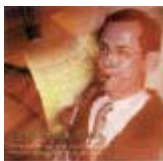
CANDLELIGHT BLUES ▶ CLICK HERE ◀