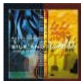
SILK & BAMBOO ▶ CLICK HERE ◀